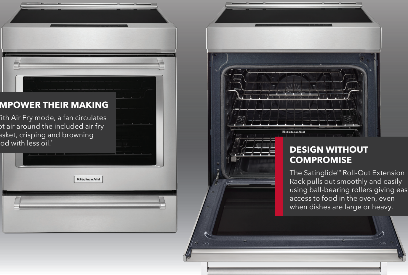
KSIS730PSS 6.4 Cu. Ft. Induction Slide-In Range

The Satinglide™ Roll-Out Extension Rack pulls out smoothly and easily using ball-bearing rollers giving easy access to food in the oven, even when dishes are large or heavy.